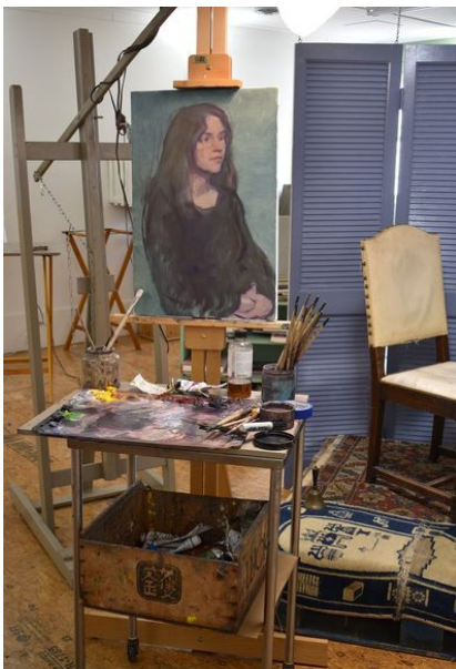
Portrait on the easel at Root Studio School

We are just getting our promotions out now so you still have time to get in on this - Join us! Summer Term Classes ( 10 week sessions) begin the first week of June. ( see pages 2 – 6 )