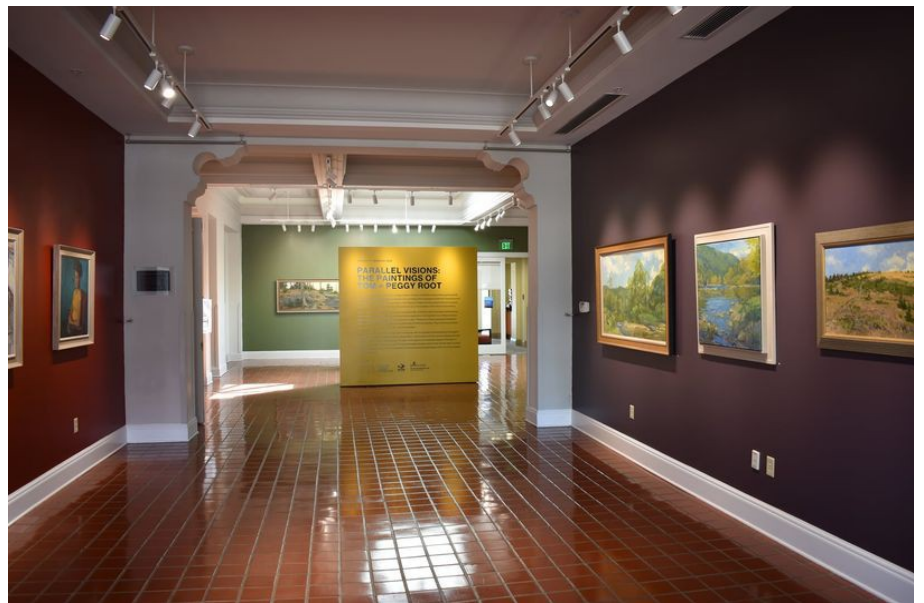
Ringling College Exhibition Jan 21 - April 15, 2022