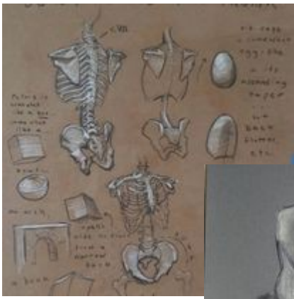
FIGURE PAINTING & DRAWING THURSDAY MORNINGS 9 – 12