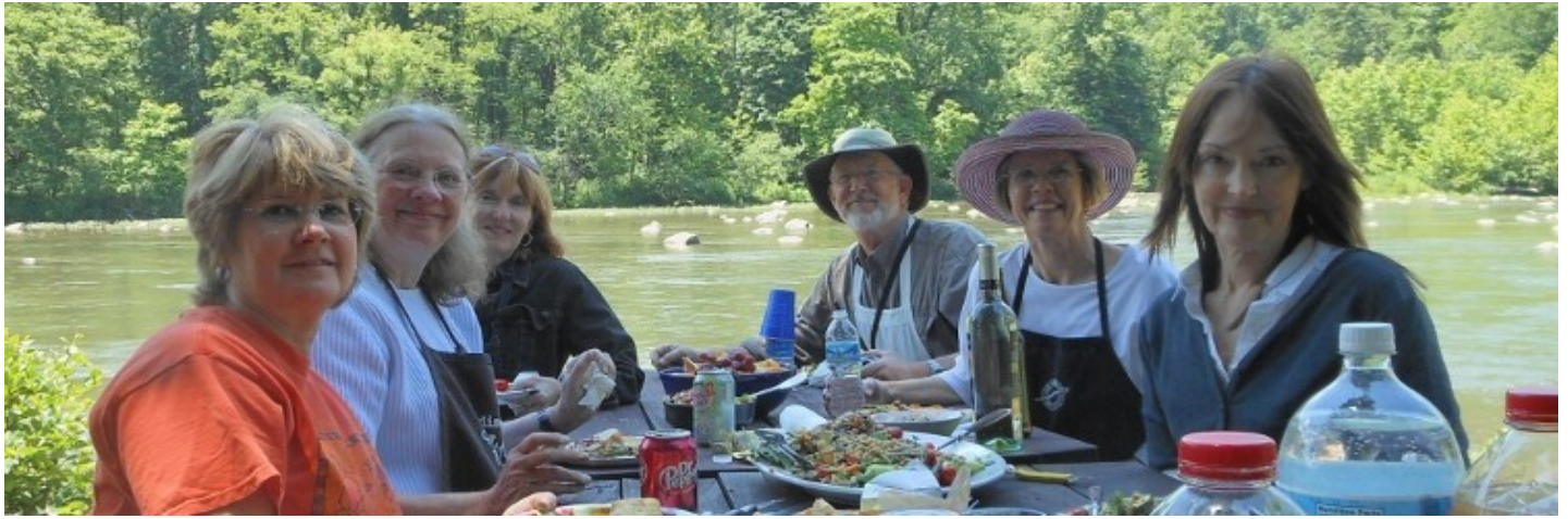
Students enjoy alfresco pot luck dining during the Painting Water Workshop June 2012 – Nolichucky River Gorge